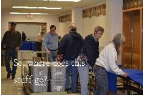
So, where does this stuff go?