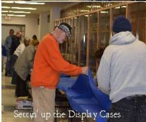
Settin' up the Display Cases.