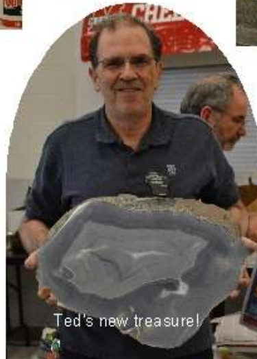
Ted's new treasure!