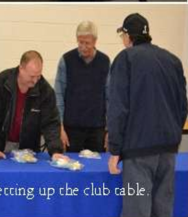
Setting up the club table.