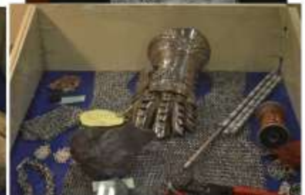
Monroe Show 2013