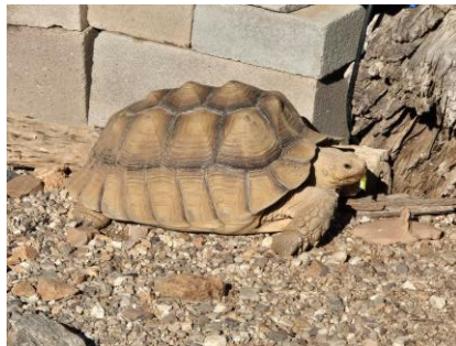
Cecil the Dessert Tortoise from the Club's Rental House in Tuscon