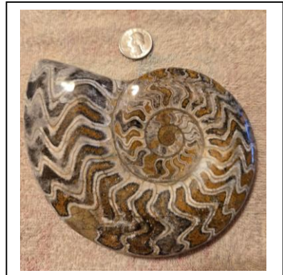
Ammonite from Morocco