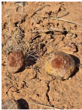
Pecos Diamonds in New Mexico